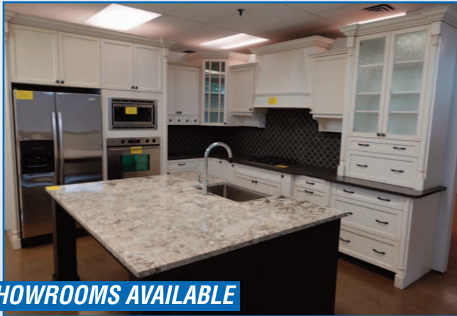
PARTIAL VIEW OF SHOWROOM KITCHENS & APPLIANCES