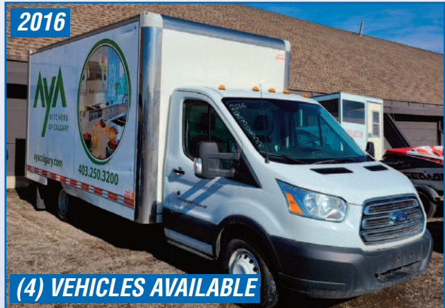
FORD TRANSIT 350 CUBE VAN

CLOSES: Tuesday June 14 th , 10:00 AM (Local)