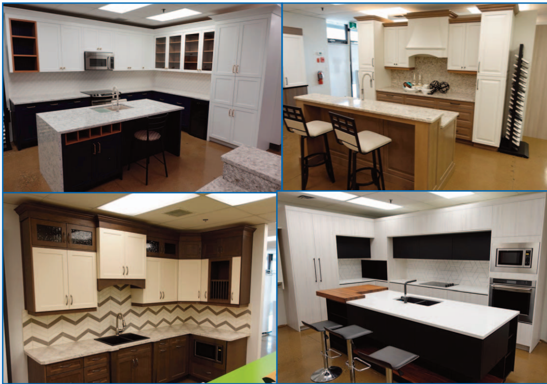
(5) SHOWROOM KITCHEN CABINET SETS W/ ISLANDS: NEW APPLIANCES - WHIRLPOOL FRENCH DOOR FRIDGE: BOSCH IN MOUNT OVEN, MODEL HBL645 A UC: NEW FRIGIDAIRE STOVE/OVEN W/ FLAT TOP BURNERS: NEW KITCHENAID IN MOUNT OVEN: NEW WHIRLPOOL IN MOUNT COUNT TOP FLAT TOP BURNERS: 2 NEW KITCHENAID MICROWAVES: NEW SAMSUNG MICROWAVE: NEW PANASONIC INVERTER MICROWAVE