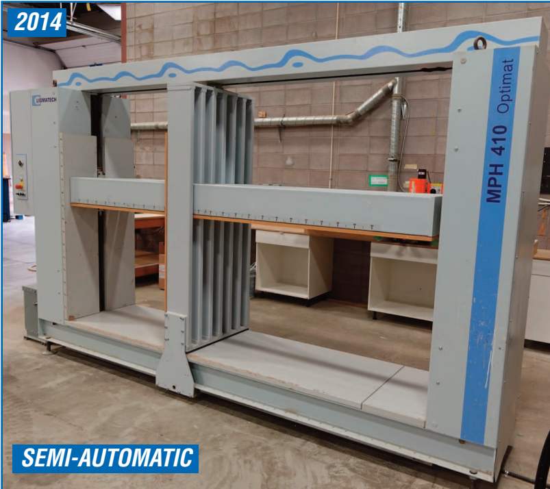
LIGMATECH MPH 410 OPTIMAT CASE CLAMP, MODEL MPH 410/25/07

WOODLAND Kitchen Cabinet Manufacturer 3833 29th Street, Unit 9, NE Calgary, Alberta