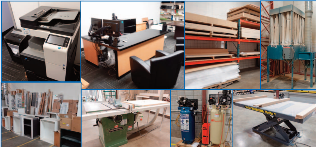
PARTIAL VIEW OF PLANT SUPPORT EQUIPMENT & INVENTORY

INVENTORY & LIFTS OF ASSORTED MDF, PLYWOOD ETC.